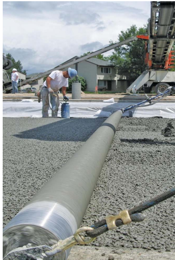
Figure 9: Roller screed

Screeding or strikeoff is usually done manually with a straightedge consisting of a rigid, straight piece of wood or metal. (Fig. 10) These screeds should be used in a slight sawing motion as it moves across the concrete, maintaining a surcharge of concrete in front of the screed to fill in low spots. A jitterbug should only be used with low slump concrete. Vibrating screeds (Figs. 5 through 8) should move rapidly to ensure consolidation but avoid working up an excessive layer of mortar on the surface.