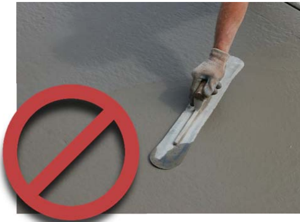
Figure 14: Steel trowel