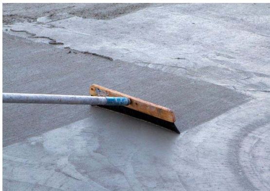
Figure 16: Brush texture on concrete

While finishing concrete, “blessing” with water or sprinkling dry cement on the concrete should NEVER occur. This can cause dusting and/or scaling. A broom or brush texture is recommended for exterior applications (Fig 16).