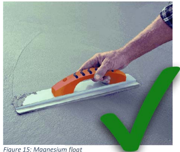
Figure 15: Magnesium float

While finishing concrete, “blessing” with water or sprinkling dry cement on the concrete should NEVER occur. This can cause dusting and/or scaling. A broom or brush texture is recommended for exterior applications (Fig 16).