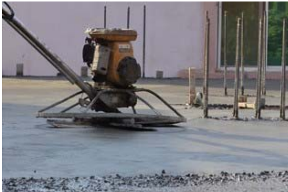
Figure 7: Vibrating Float