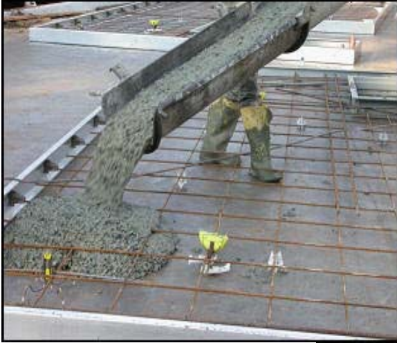
Figure 1: Reasonable slump concrete being placed near its final location.