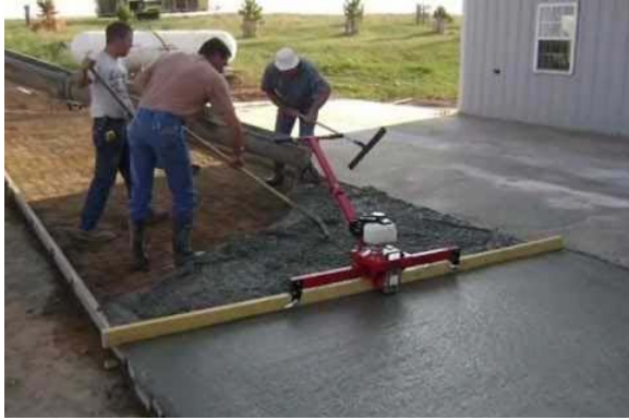
Figure 5: Vibrating screed