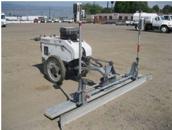
Figure 8: Laser screed