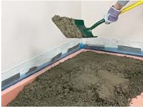
Figure 3: Square-ended shovel