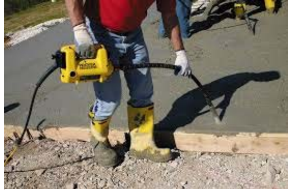
Figure 6: Internal vibrator