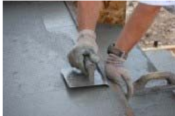
Figure 13: Edger

*Use care when bull floating to prevent sealing of the surface. If the surface becomes sealed, bleed water will collect just beneath the surface instead of on top of it, and create a weak plane. If this happens, the surface may blister during finishing or delaminate after the concrete hardens.