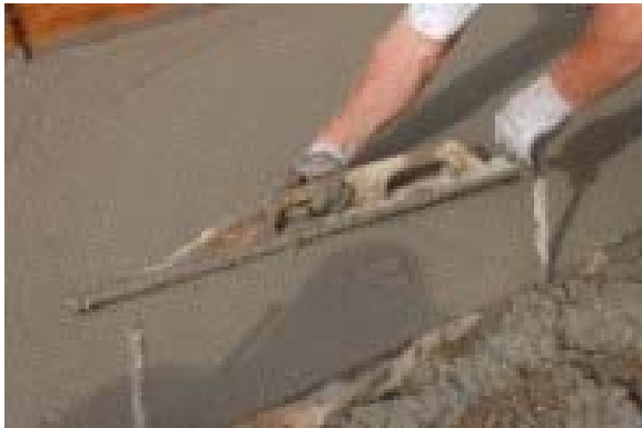
Figure 12: Darby