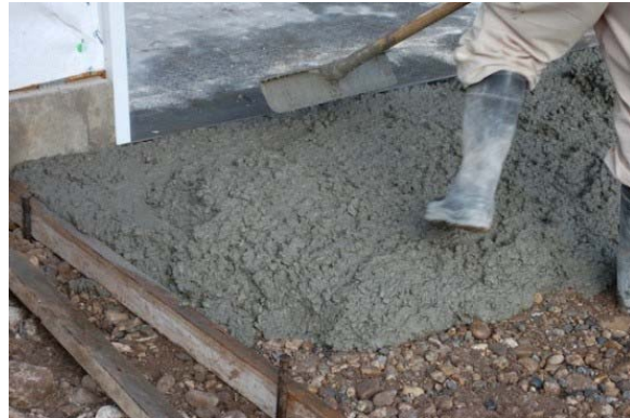
Figure 4: Concrete rake

Spreading of concrete can be achieved by use of a short-handled, square-ended shovel (Fig. 3), come-alongs, or concrete rakes (Fig. 4). Never use a garden rake or shaft vibrator to spread concrete horizontally. (These methods of movement cause segregation)