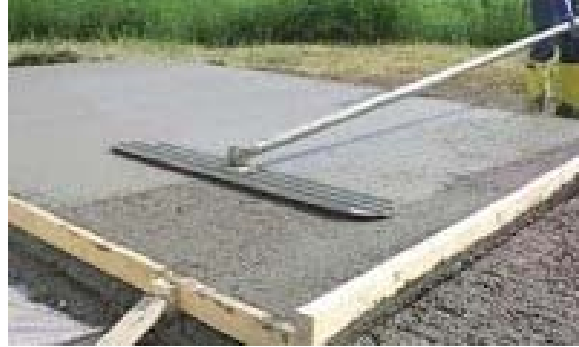
Figure 11: Bull float