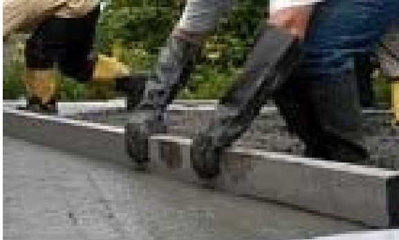
Figure 10: Metal straightedge

Immediately after screeding and before bleed water appears, the concrete must be further leveled using a bull float (Fig. 11), darby (Fig. 12), or highway straightedge. The bull float or darby embeds large aggregate, smooths the surface, and takes out high and low spots. Use an edger (Fig. 13) to round and compact the concrete eliminating square edges that are prone to chipping.