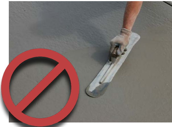
Figure 14: Steel trowel