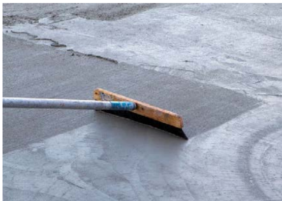
Figure 16: Brush texture on concrete

While finishing concrete, “blessing” with water or sprinkling dry cement on the concrete should NEVER occur. This can cause dusting and/or scaling. A broom or brush texture is recommended for exterior applications (Fig 16).