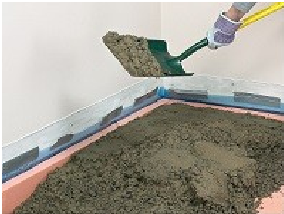
Figure 3: Square-ended shovel