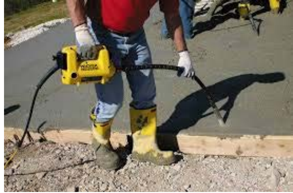
Figure 6: Internal vibrator