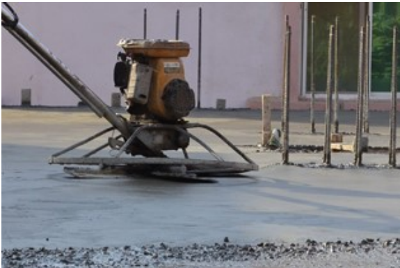
Figure 7: Vibrating Float