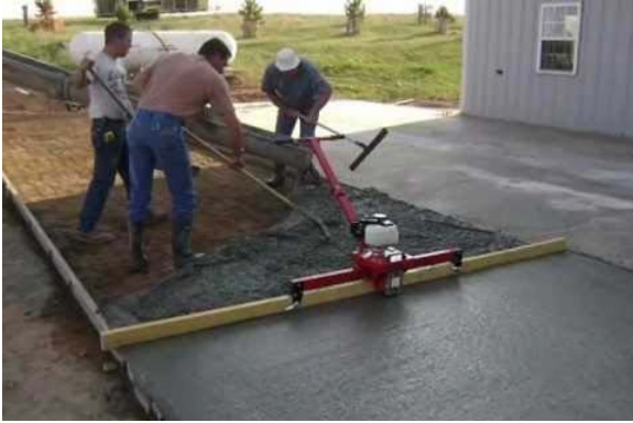
Figure 5: Vibrating screed