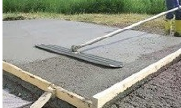
Figure 11: Bull float