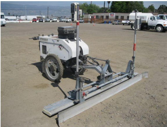
Figure 8: Laser screed