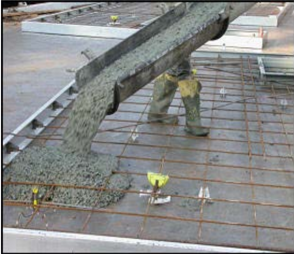
Figure 1: Reasonable slump concrete being placed near its final location.