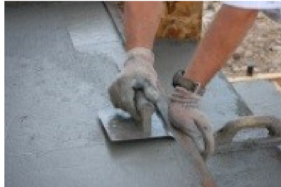
Figure 13: Edger

*Use care when bull floating to prevent sealing of the surface. If the surface becomes sealed, bleed water will collect just beneath the surface instead of on top of it, and create a weak plane. If this happens, the surface may blister during finishing or delaminate after the concrete hardens.