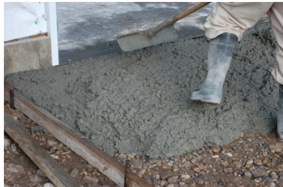
Figure 4: Concrete rake

Spreading of concrete can be achieved by use of a short-handled, square-ended shovel (Fig. 3), come-alongs, or concrete rakes (Fig. 4). Never use a garden rake or shaft vibrator to spread concrete horizontally. (These methods of movement cause segregation)