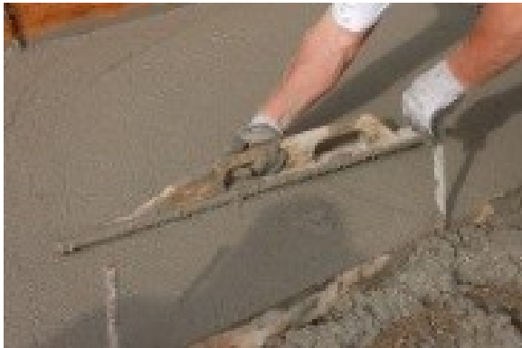
Figure 12: Darby