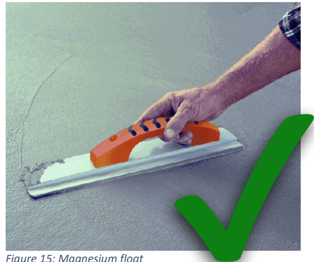
Figure 15: Magnesium float

While finishing concrete, “blessing” with water or sprinkling dry cement on the concrete should NEVER occur. This can cause dusting and/or scaling. A broom or brush texture is recommended for exterior applications (Fig 16).