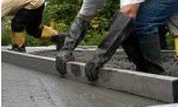
Figure 10: Metal straightedge

Immediately after screeding and before bleed water appears, the concrete must be further leveled using a bull float (Fig. 11), darby (Fig. 12), or highway straightedge. The bull float or darby embeds large aggregate, smooths the surface, and takes out high and low spots. Use an edger (Fig. 13) to round and compact the concrete eliminating square edges that are prone to chipping.