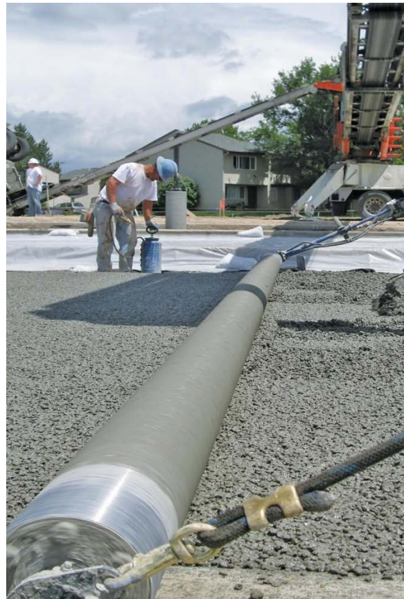
Figure 9: Roller screed

Screeding or strikeoff is usually done manually with a straightedge consisting of a rigid, straight piece of wood or metal. (Fig. 10) These screeds should be used in a slight sawing motion as it moves across the concrete, maintaining a surcharge of concrete in front of the screed to fill in low spots. A jitterbug should only be used with low slump concrete. Vibrating screeds (Figs. 5 through 8) should move rapidly to ensure consolidation but avoid working up an excessive layer of mortar on the surface.